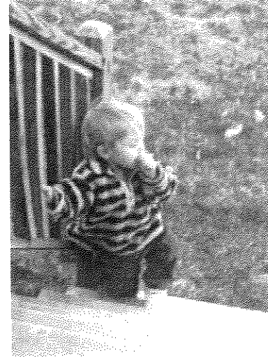
Children touching unsealed treated wood, and then putting their hands in their mouths is the biggest concern.

Too much arsenic can cause cancer. So it is good to prevent arsenic getting into your body when you can. When you touch wood treated with arsenic, you can get arsenic on your hands. The arsenic on your hands can get into your mouth if you are not careful about washing before eating. Young children are most at risk because they are more likely to put their hands in their mouths. The good news is that there are simple things you can do to protect yourself and your family from arsenic treated wood. This fact sheet will tell you how.